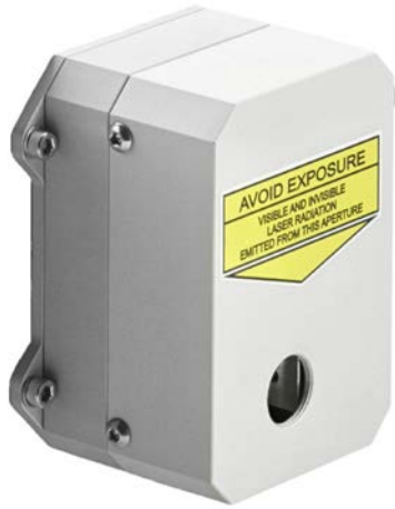
Attachable motorized attenuator AT