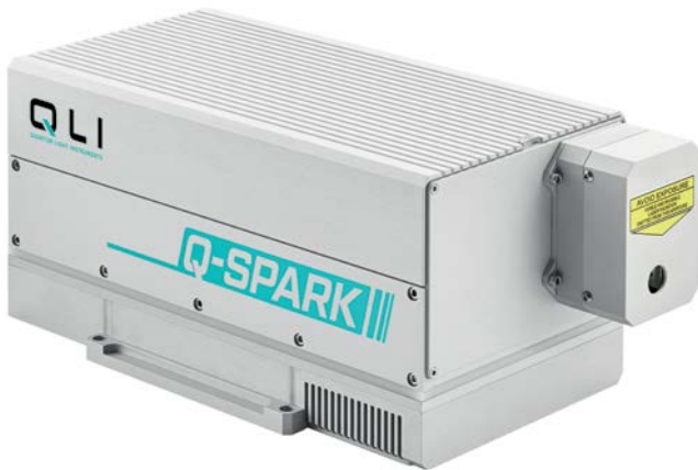
Q-SPARK with AT motorized attenuator attached