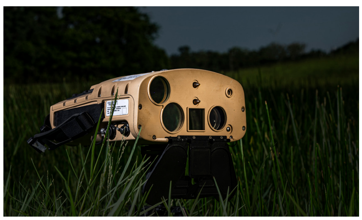
Incorporated into Marine Corp NGHTS handheld.

AIRTRAC-LP with example custom packaging configuration